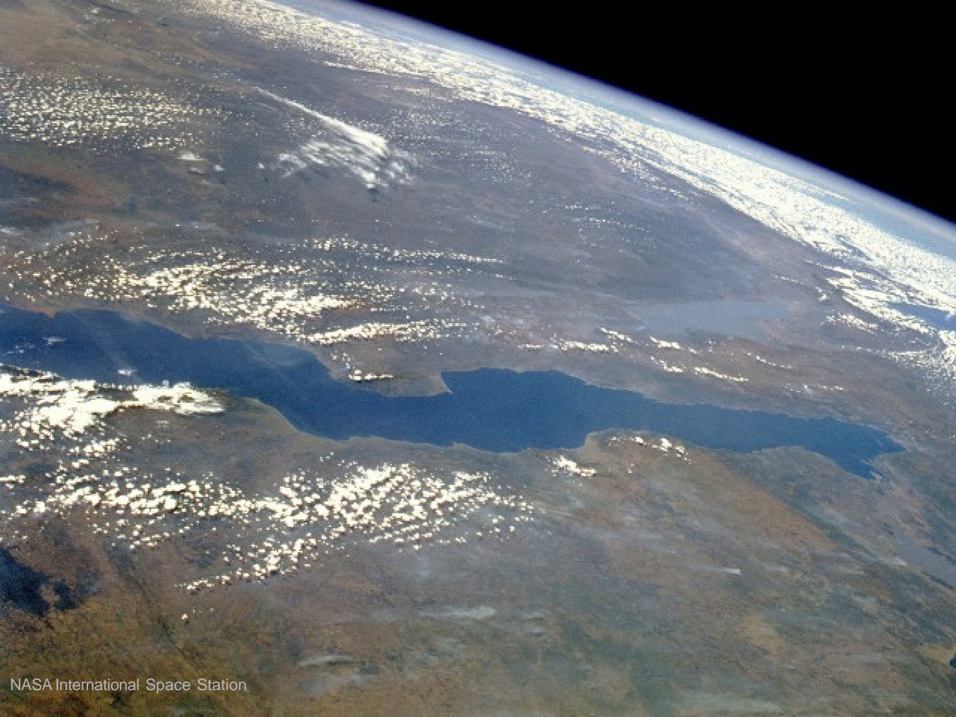
NASA International Space Station